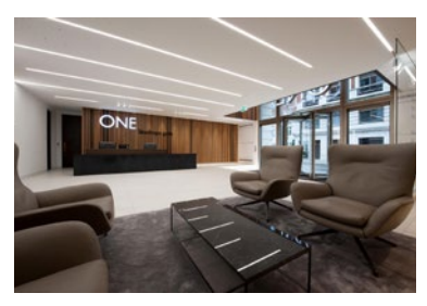
One Stanhope Gate, Mayfair, London W1

During Q3, the Fund sold a prominent headquarter office building situated at One Stanhope Gate, in the west end of London. The property, which was built by Lothbury in 2000, comprised 33,895 sq ft of accommodation arranged over basement, ground and six upper floors. The building was let until March 2027 to the investment banking firm, Evercore. The property was sold in September for a price in excess of £70m.