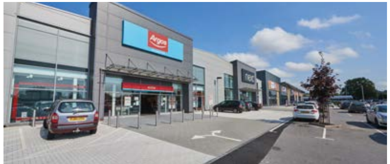
Southampton Retail Park, Salisbury

2021 was an exceptional year for the industrial investment market with transaction volumes in excess of £15.2bn, almost double the previous record 3 . Transaction volumes in Q1 2022 were c.£3bn reflecting a c. 15% reduction on the same period last year. That said, this does not seem to have put a dampener on pricing, which remains as strong as ever with the average industrial yield reaching an all-time low of 3.53% 2,3 . Take up of UK logistics space totalled 10.43m sq ft in Q1 representing an increase of 100% compared to Q1 2021's figure of 5.21m sq ft 4 .