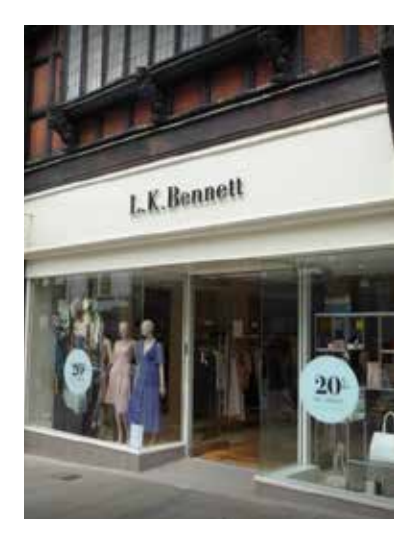
High Street, Guildford

The LSH All Property average transaction yield reduced by 22 bps in Q2 to 5.45%. This is the lowest level since Q4 2007. Retail yields lowered to 5.74% (-37 bps) and industrial yields to 5.00% (-61 bps, largely demanddriven). Prime yields remained stable across the main sectors, however Retail Warehouse moved out by 25 bps to 4.75%.