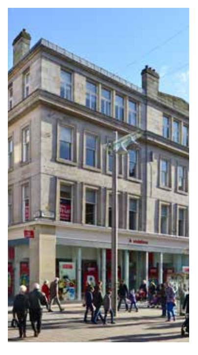
Buchanan Street, Glasgow

During Q2, two strategic sales totalling £37m were completed from the retail element of the portfolio. The first was in Glasgow and comprised a large retail and office building located in a corner position fronting Buchanan Street and Exchange Place. The ground and basement of the building were let to Vodafone, Lush, Starbucks and a local restaurant operator, whilst the first to third floor office spaces were let to a variety of tenants. This sale completed at a price of £31m which reflected a net initial yield of 3.99%. The second sale which completed was on High Street, Guildford and comprised a small retail unit let to LK Bennett until 2026 (with a break clause in 2021). This property was sold at a price of £6m which reflected a net initial yield of 4.5%.