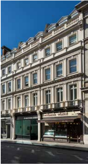
Bedford Street, London

During Q1, the Fund purchased one industrial asset in Leeds during the quarter in a deal worth £9.15m. The property consists of two modern logistics units between the city centre and junction 45 off the M1 Motorway. The property is let to Fed Ex and Perspex Distribution on RPI-linked leases.