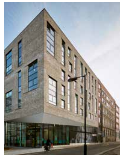
Student accommodation, Camberwell

The LSH All Property average transaction yield increased by 11 basis points in Q1 to stand at 5.67%. Overall, Q1's All Property transaction yield movement was linked to the nature of stock as opposed to lower prices. Retail yields remained stable at 6.11% and industrial yields rose to 5.61% (+12bps). Prime yields remained stable across the sectors, however industrial subsectors hardened by 25bps to new all-time lows, with the South East industrial prime yields now standing at 3.75%.