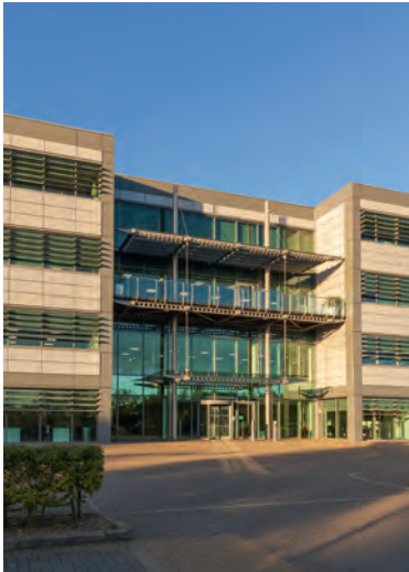
Reed House, Norwich

During Q1 2020, there were two assets sold from the portfolio. The sale of a small retail property at 21-23 Eastgate Street in Chester completed in January at £1.75m and the Fund also completed on the sale of Reed House, a 52,000 sq ft office building at Broadland Business Park in Norwich for £10.6m in March.