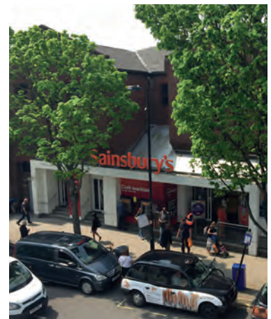
Sainsbury's, Islington, London

Latest MSCI data shows that the yields continued outward movement after reaching minimal levels in Q3 2018. IPD retail net initial yield increased by 29bps in Q1, industrial and office yields increased by 4bps and 2bps respectively, relative to Q4 2019 5 .