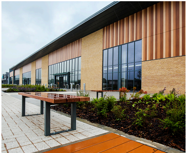
Southampton Road Retail Park, Salisbury

Overall, for Q2 2016 the IPD UK Quarterly Property Fund Index for all property recorded a total return of 0.4% which comprised of an income return of 0.7% and a capital return of -0.4%. The negative capital return was largely due to the write down of valuations following BREXIT.