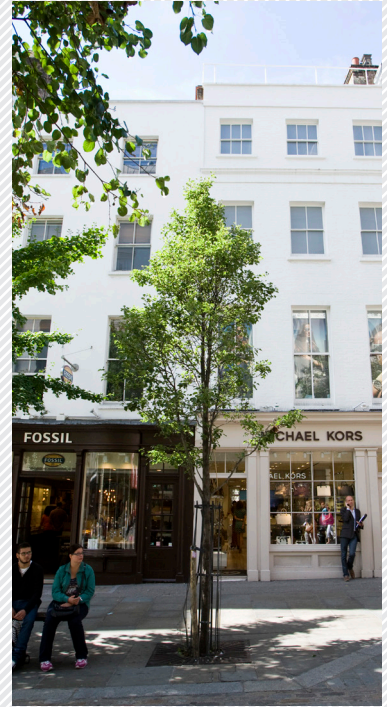
28-29 James Street, Covent Garden, London WC2

The proceeds of these sales have principally been allocated to the ongoing development projects in the Fund, most notably the student accommodation developments in Aberdeen, Durham and Camberwell in South London, in addition to the ongoing retail and residential project at James Street, Covent Garden. Two of the student schemes (Aberdeen and Camberwell) are due to complete in September ready for the 2016 academic year with the final scheme in Durham due to complete in September 2017.