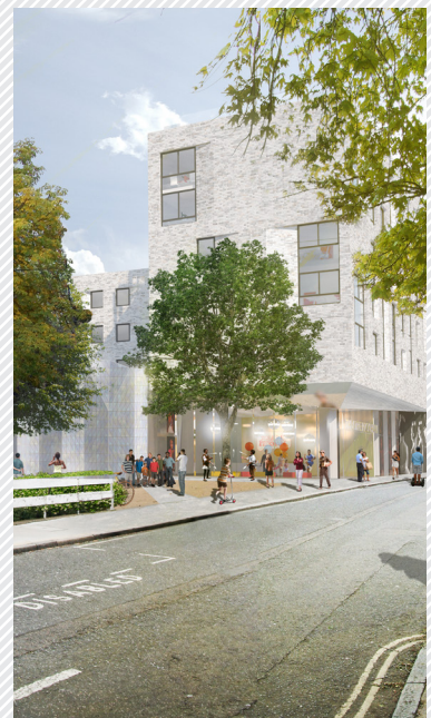
31 Peckham Road, Former Southwark Town Hall, Camberwell