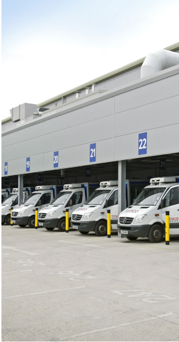
Priory Park, Mills Road, Aylesford